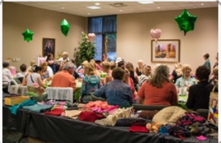
CCRWC June 2017 Spring Fling